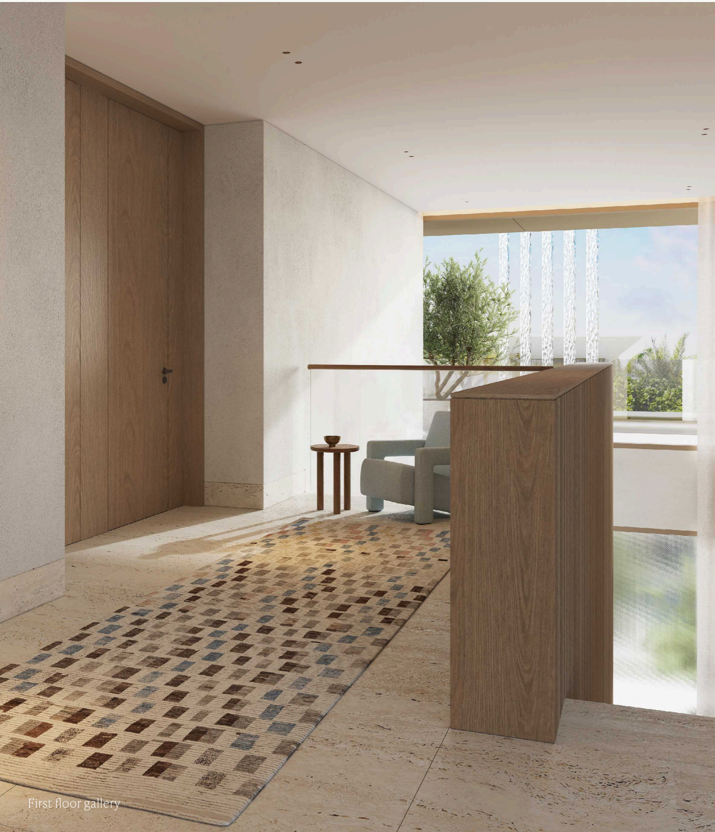
First floor gallery